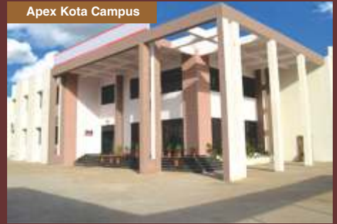
Apex Kota Campus