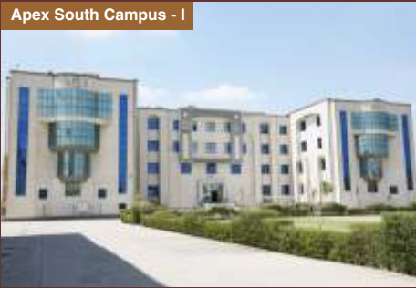
Apex South Campus - I