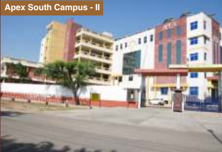
Apex South Campus - II