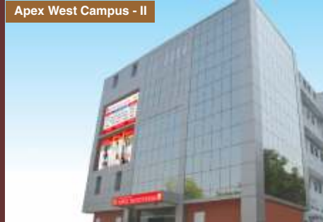
Apex West Campus - II