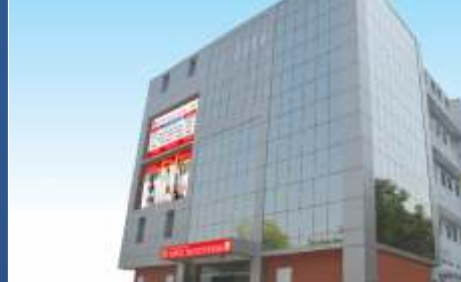
Apex West Campus - II