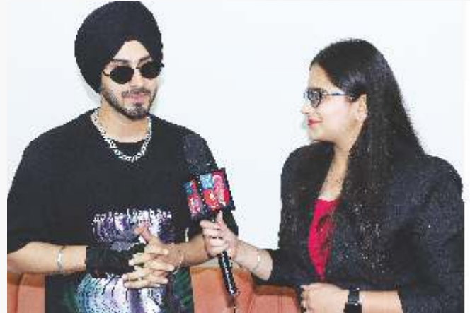
Bollywood Singer Rohanpreet interviewed by students