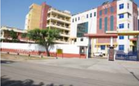
Apex South Campus - II