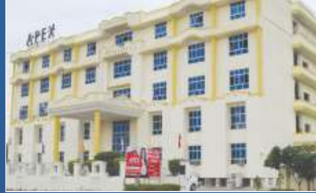
Apex West Campus - I