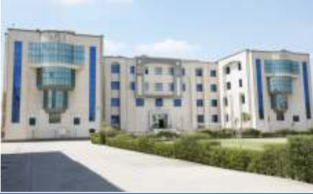
Apex South Campus - I