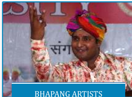
BHAPANG ARTISTS Journalism Session