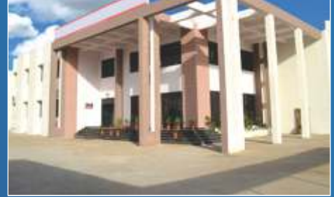
Apex Kota Campus