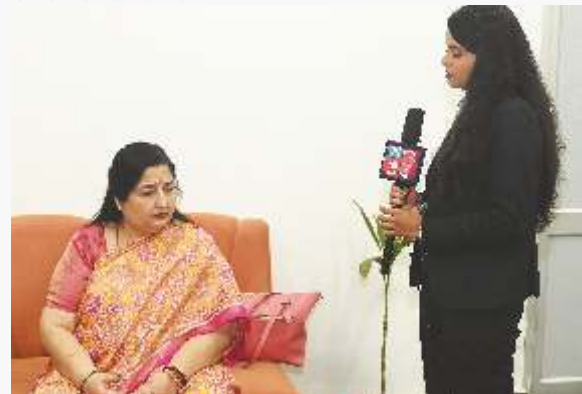
Padma Shri Anuradha Paudwal interviewed by students