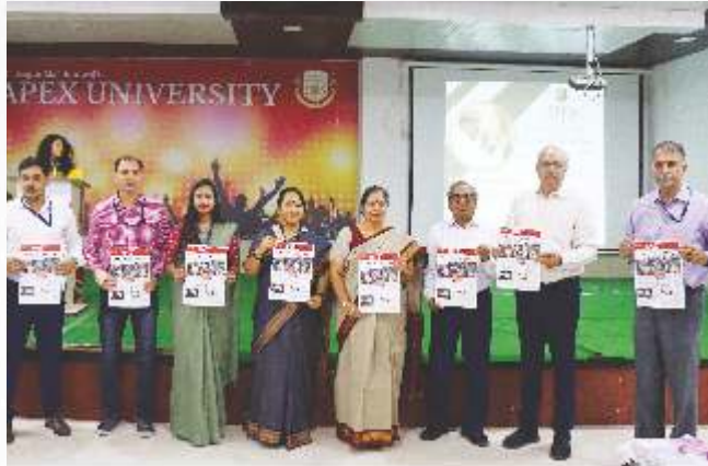
Launching Apex Today newspaper