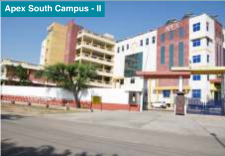
Apex South Campus - II