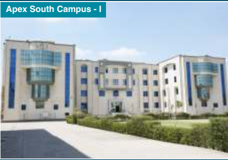
Apex South Campus - I