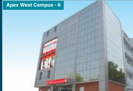
Apex West Campus - II