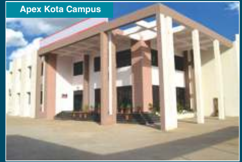
Apex Kota Campus