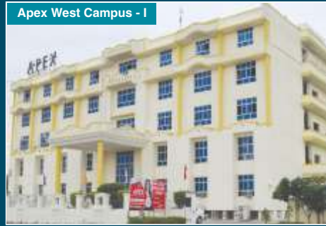
Apex West Campus - I